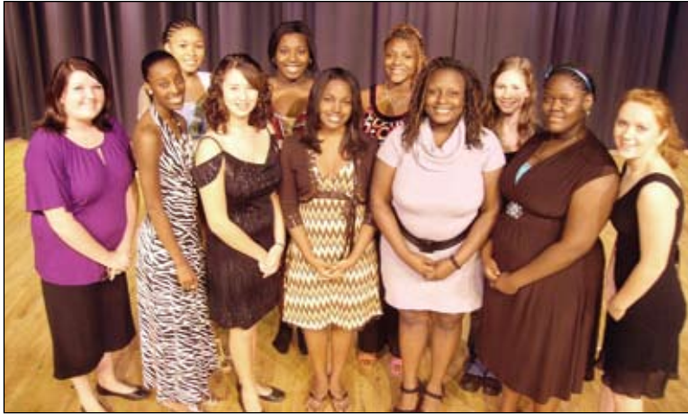
Voices of Berkeley, Berkeley County Schools, will be the musical selection during the closing general session on Sunday, February 21

Additional Reception Wrist Bands may be purchased for $50 each and must be reserved on the convention registration form, as well as the district's attendance sheet.