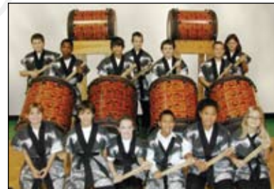
Carolina Forest Elementary Taiko Drum Ensemble, Horry County Schools, will perform during the Saturday evening reception.

of instructional materials, and more. Trade show hours are Friday, 7:30 - 11 a.m. and 12:15 - 3:30 p.m. and Saturday, 7:30 - 11:30 a.m.