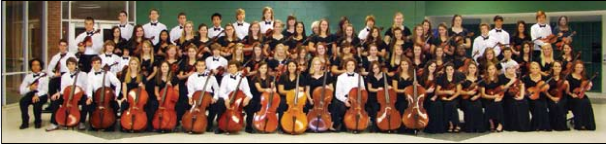
Myrtle Beach High School Orchestra, Horry County Schools, will be the musical selection during the opening ceremony on Friday, February 19.