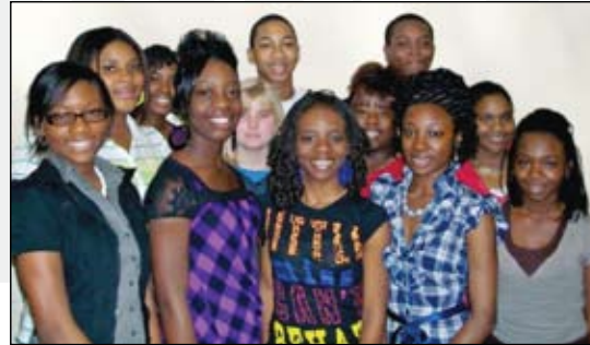
Blackville-Hilda High School Chorus, Barnwell 19 Schools will be the musical selection during the second general session on Saturday, February 20.